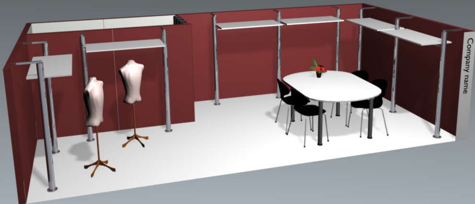
The picture shows an 18 m 2 stand