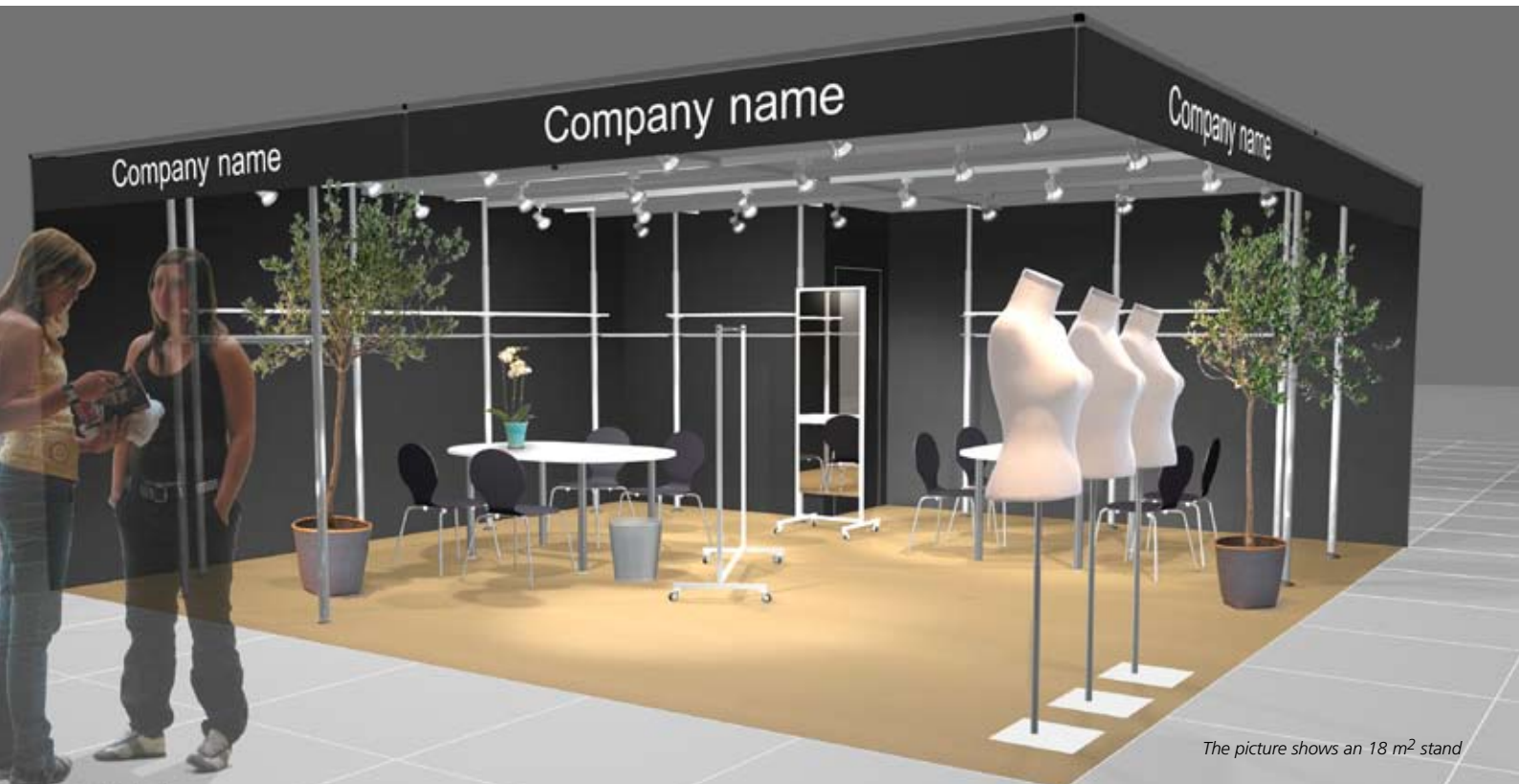
The picture shows an 18 m 2 stand